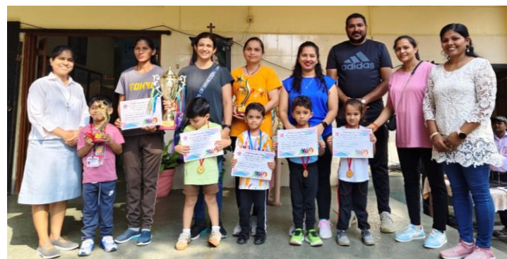
Junior KG- Minithon Winners