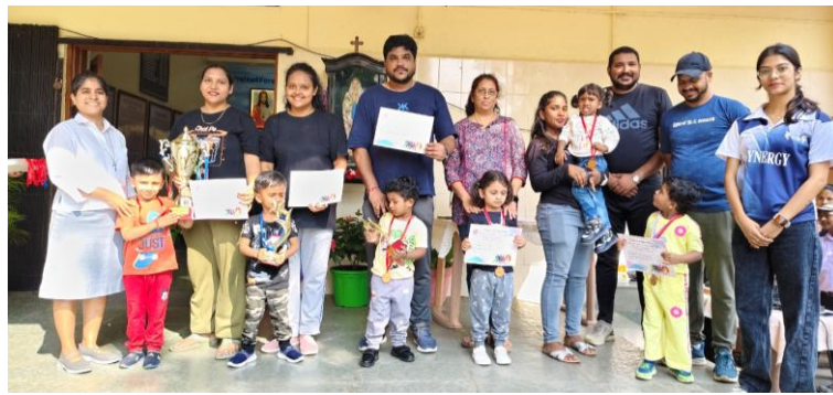
Nursery- Minithon Winners