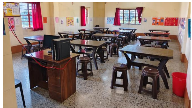
Library- New Tables and stools