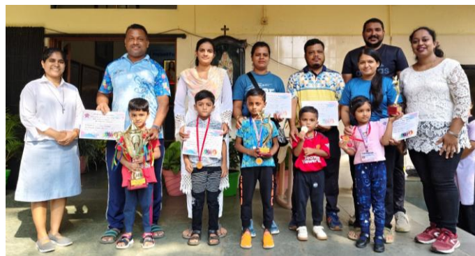
Senior KG- Minithon Winners