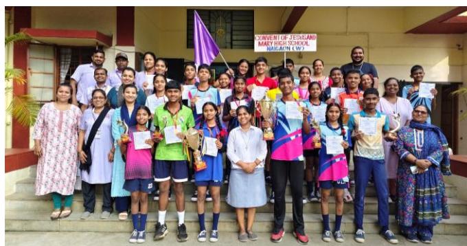
Grade 7 to 10- Marathon Winners